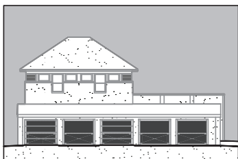
● ANTIETAM STREET (SOUTH) ELEVATION