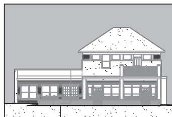
● VIEW FROM WOMEN'S CLUB (NORTH) ELEVATION