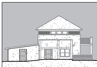
● S. PROSPECT STREET (EAST) ELEVATION